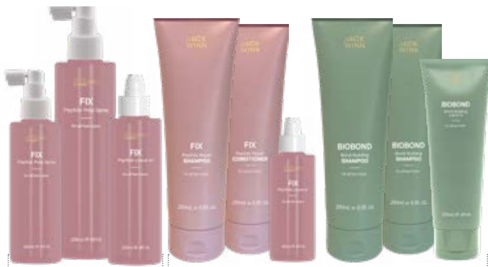
IN SALON USE